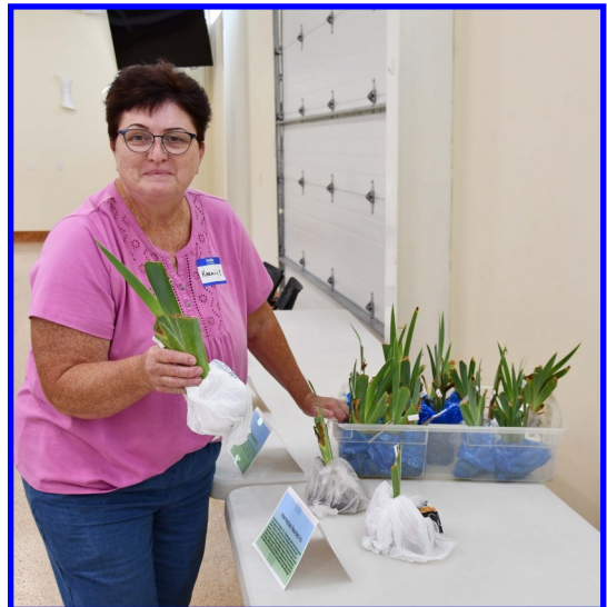
Karmin prepares plants for sale in live auction