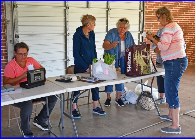
The day starts with the plant sale