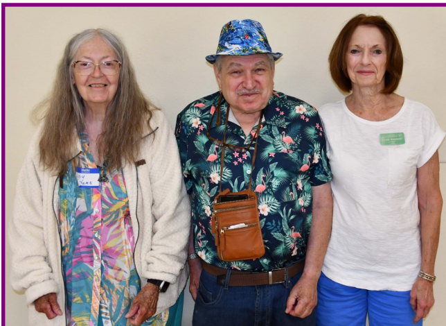
And , then, there were 3 Charter Members