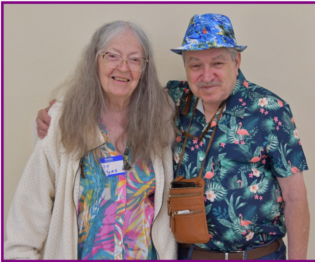
At first there were 2 Charter Members.....